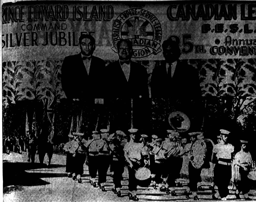
AT PROVINCIAL LEGION CONVENTION