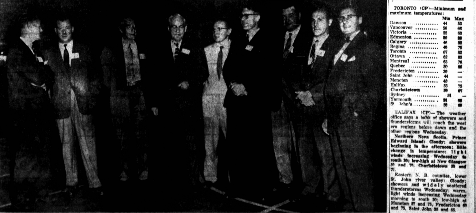
MEDICAL SOCIETY OF P. E. ISLAND ANNUAL MEETING