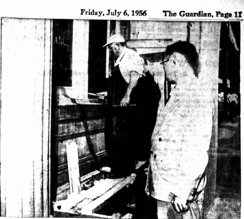
LEGITIMATE BANK "BREAK" — The Royal Bank's Charlottetown branch is not breaking into the wall so that they can install a new "Night Depository" to enable customers to make deposits outside regular banking hours.

Called a Night Depository, it is a means whereby cash and other receipts can be left with the bank outside normal banking hours, for deposit later on.