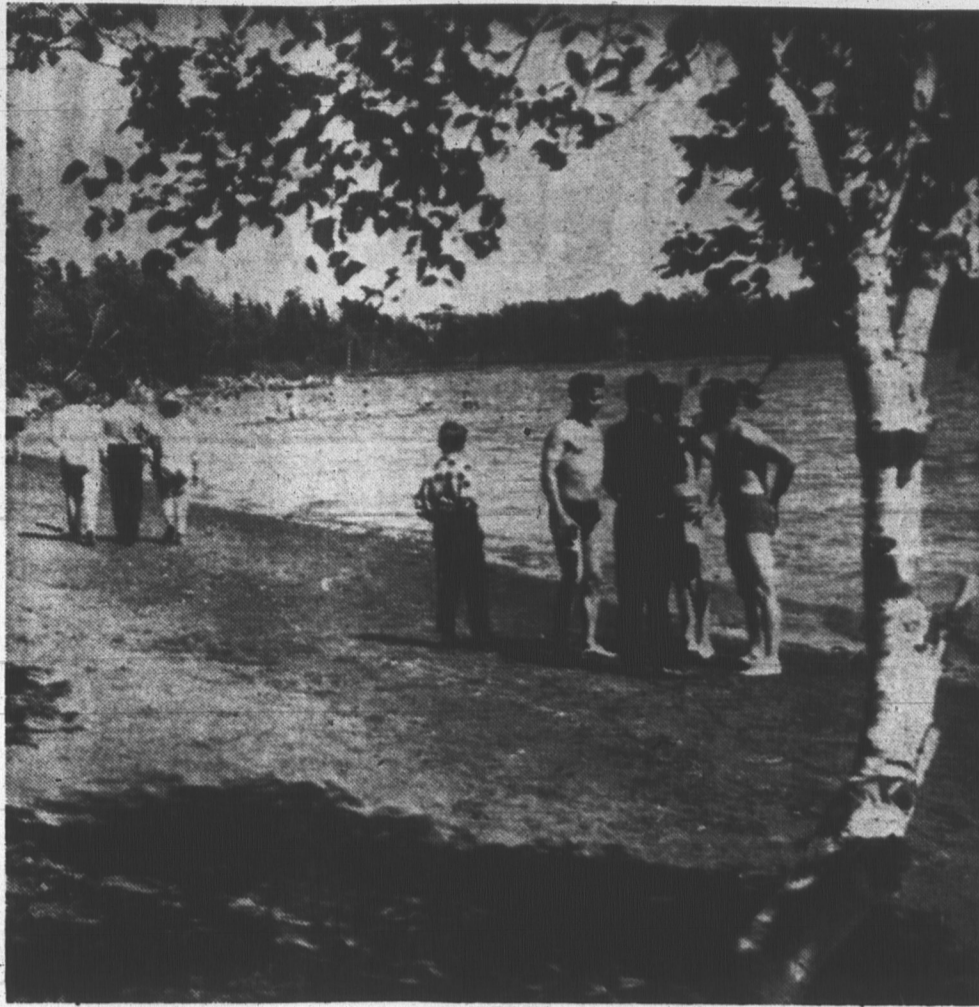
BEAUTIFUL BRUDENELL BEACH

McInnis Photo-Hobby 111 Kent St. Ch'town