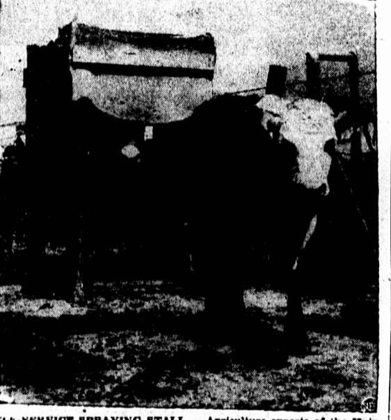
SELF-SERVICE SPRAYING STALL — Agriculture experts of the University of Illinois rigged up this bovine "beauty parlor" at Dixon Spring, Ill., where fly-tortured cattle can get relief. When Bossie walks through the stall, she trips a bellows mechanism that releases insecticide over her body, killing pesky noseflies.