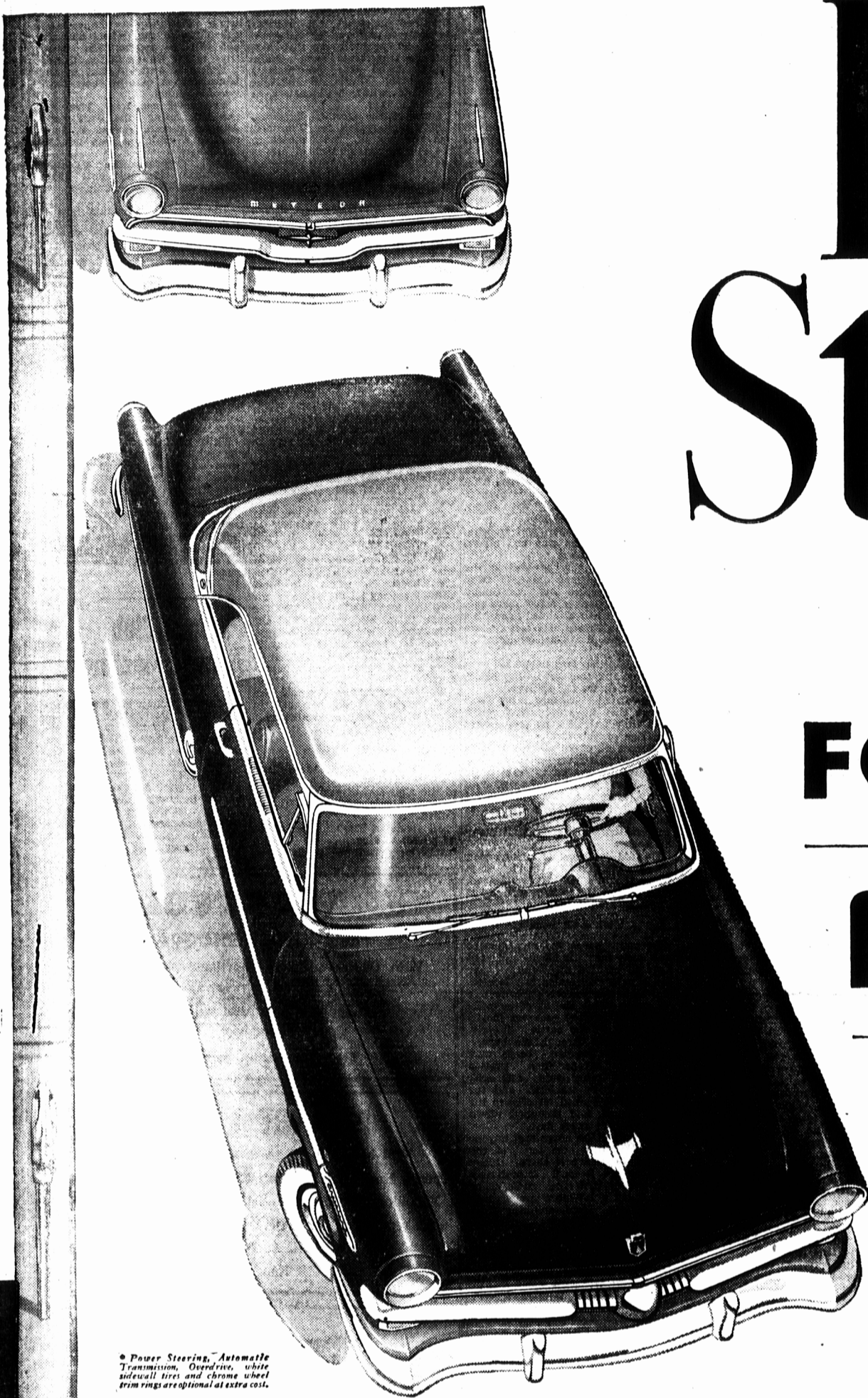
* Power Steering, Automatic Transmission, Overdrive, whitewall tires and chrome wheel trim rings are optional at extra cost.