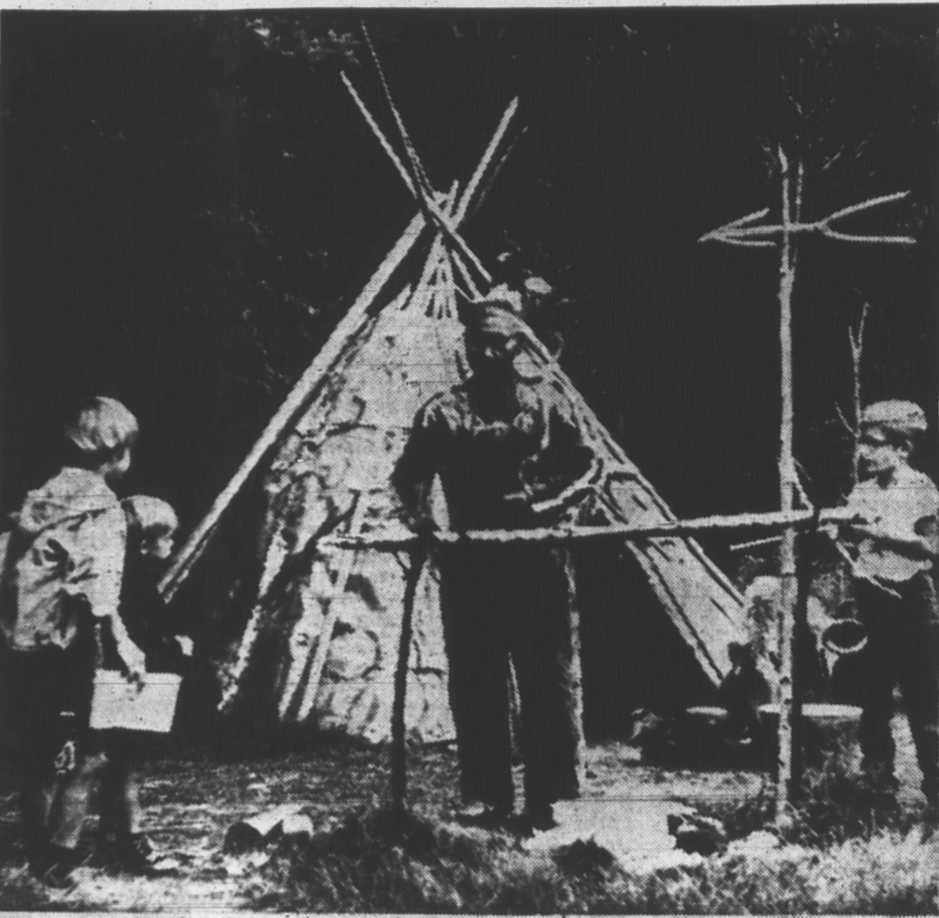
Mic Mac Indian Village located at Rocky Point, P.E.I.

3 miles from Charlottetown On Trans-Canada Highway to Borden ● Speakers for 400 cars Shows seven nights a week ● Modern up to date Canteen ● First run movies