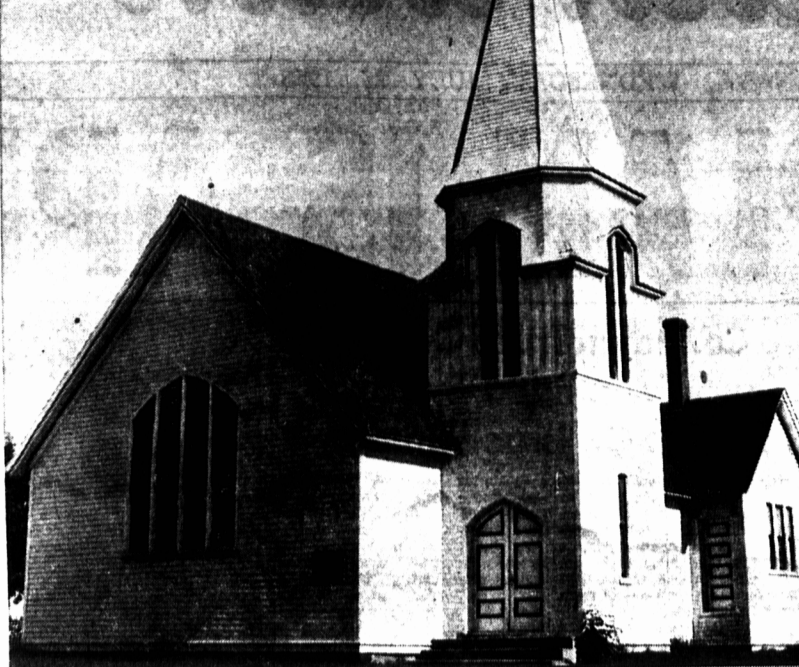
CAVENDISH UNITED CHURCH