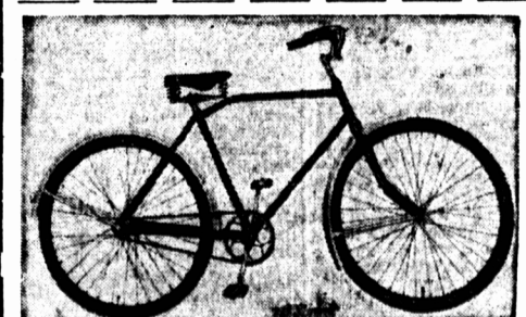
THISTLE DELUXE MODEL

You'll Save Bus Fare when you Ride a New THISTLE BICYCLE