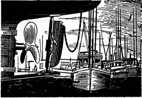
With the full power of the engine behind it, a propeller shaft has to have great strength and stiffness or it will bend or break. "Monel" shafts give remarkable satisfaction and long life.