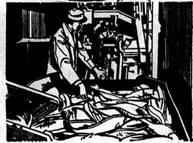
Equipment made of Nickel alloys is used in handling and canning fish and other sea food because it is rust-proof, sanitary and stands an immense amount of wear.

Forty-three years of research have uncovered hundreds of uses for Nickel in the United States and other countries. Now Nickel exports bring in millions of U.S. dollars yearly. These dollars help pay the wages of the 14,000 Nickel employees in Canada and also help pay Canadian railwaymen, lumbermen, iron and steel workers and other men and women making supplies for the Nickel mines, smelters and refineries.