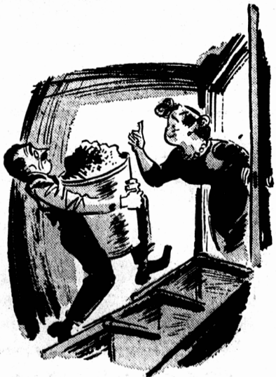
"Put it down, dear, the Browns have just dropped in"

Heat with oil and rid yourself of troublesome furnace care, the worries of uncertain heat... An Imperial Oil contract, with the Imperial Weather-controlled delivery service, gives you comfort, convenience, cleanliness automatically... The Esso Oil Burner has fuel-saving features no other burner can offer... Ask about the convenient Deferred Payment Plan.