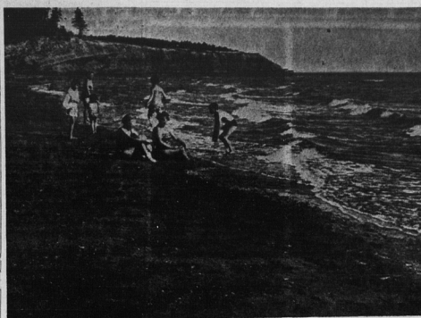
Beautiful scenery attracts many tourists to Prince Edward Island; aptly known as one of the loveliest Provinces in the entire Dominion of Canada. Scenes such as this one are typical and are to be found in every section of the Province. It is a small wonder many tourists travel here each year.