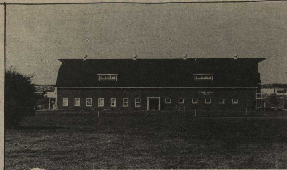
Your Favourite, The Barn

I liked Three Oaks atmosphere and scenery.