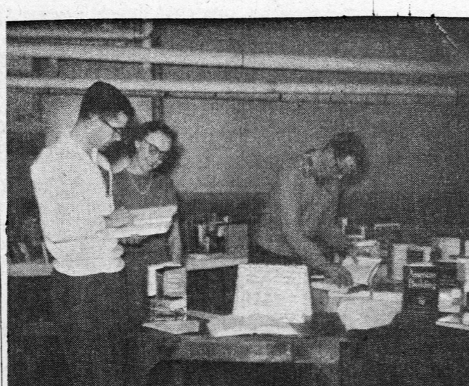
STUDENTS EXAMINE CARNEGIE GIFT BOOKS

LEGION MEETING The annual meeting of the Charlottetown Branch Canadian Legion, B.E.S.L., will be held in the Branch Home tonight 7:30 p.m. Agenda: General Business. Election of officers.