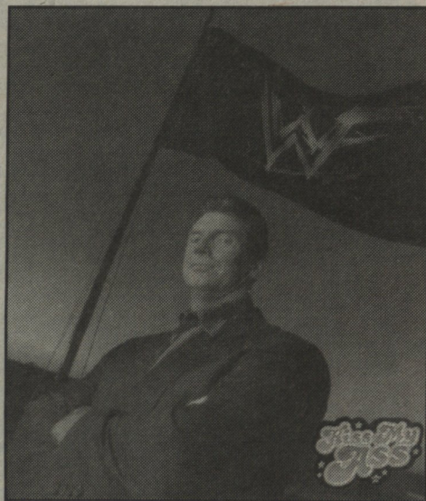
The Big Kahuna, Vince McMahon

One thing I don't get about the whole baseball set up is that you can finish third in your division and still not make the damn playoffs. I'd have to say the NBA has the best arrangement: four teams in each league make it but the first round in the best of 5