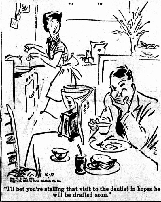
"I'll bet you're stalling that visit to the dentist in hopes he will be drafted soon."