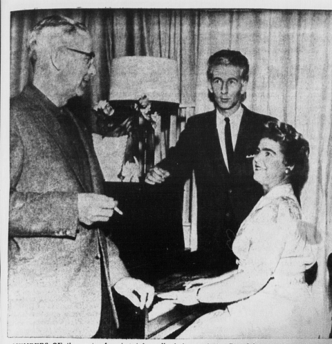
MEMBERS of the east of the St. Charles Auxiliary of the Charlottetown Hospital's annual Easter Monday play.