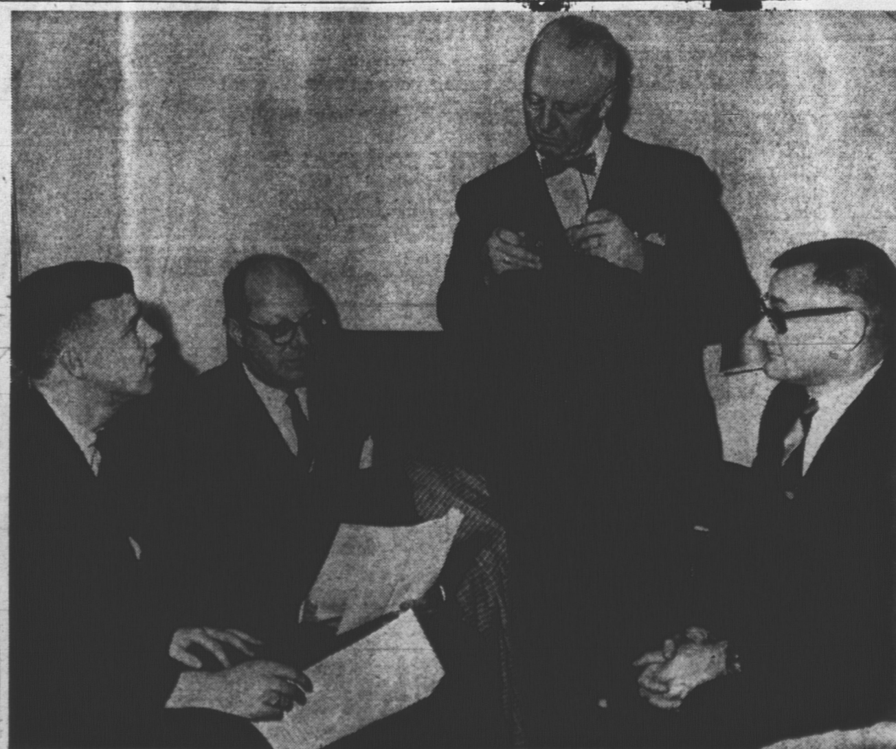
CORRECTIONS COMMITTEE VISITS PROVINCE

The rest of the skeleton was to be sent to Quebec City, 110 miles to the south.