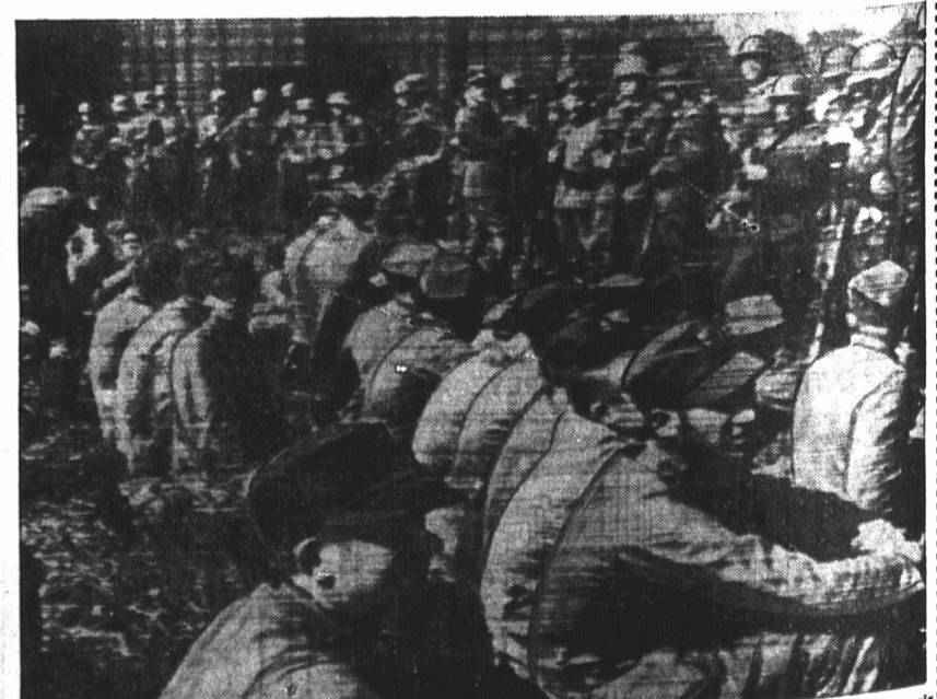
Fighting Men—Guarded by Nazis, the heroic defenders of Westerplatte, Polish fortress in Danzig harbor, are pictured in a temporary prison camp. Germans were loud in praise of the eight-day defense of the fortress before the terrific bombardment from the sea and air forced surrender.