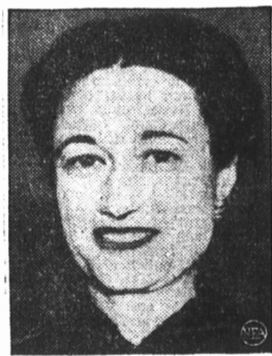
Returning to England from France with his Duchess, the former Wally Simpson, the Duke of Windsor, is supposedly to attach himself to a British regiment. The ex-king still holds Commission as Colonel-in-chief of the Welsh Guards, in uniform of which he is shown.