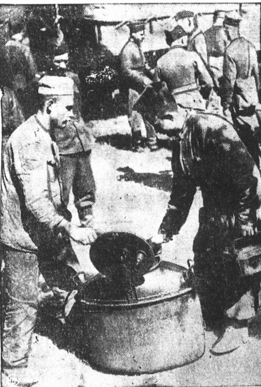
Welcome interlude in the hectic business of war. Polish troopers get their rations during temporary halt on way to the front. Picture, one of the first taken behind Polish lines, was passed by censor, rushed to U.S. by clipper plane.