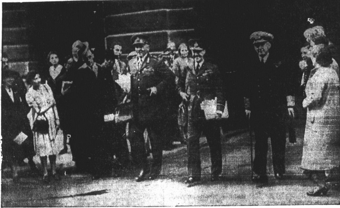
Perfect accord seems to be the order of the day as Great Britain's three war chiefs beam with smiles as they leave No. 10 Downing Street, London, after a conference. Shown in front of "the heart of the British Empire" are left to right: Sir Edmund Ironside, Chief of the British Expeditionary Forces; Air Marshal Sir Cyril L. N. Newall, head of Britain's Air Forces, and Admiral Sir Dudley Pound, First Sea Lord.