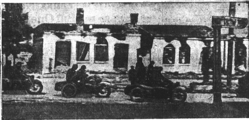
German mechanized units speed through the Polish village of Szczecow after military fire had battered the town into submission, forced Polish troops to retreat. Effects of the bombardment can be seen in the wrecked buildings above.