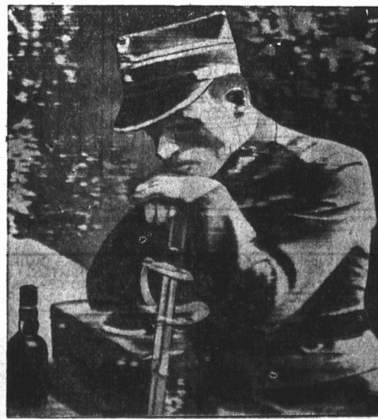
Won Nazis' Tribute—A picture of complete despair after the surrender of Westerplatte, Danzig harbor fortress, the commander of the heroic Westerplatte "suicide squad" is shown leaning on the sword that his Nazi conquerors permitted him to keep as a token of their esteem.