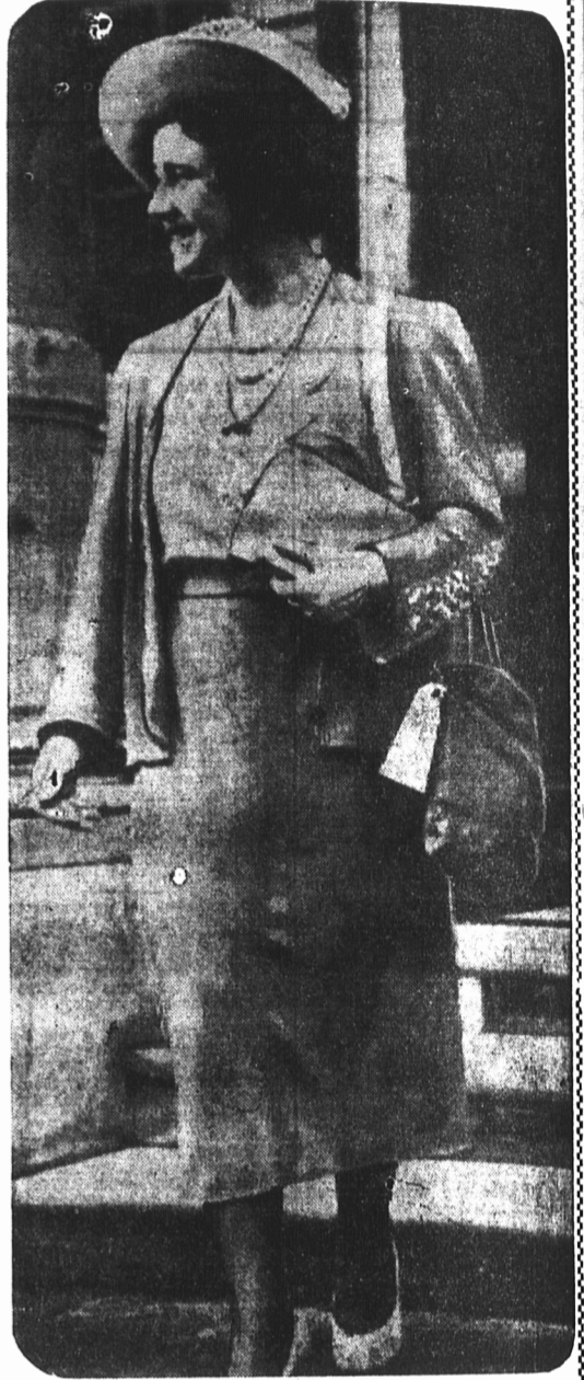
Royalty as well as commoners in London carry gas masks with them in these days of war. Queen Elizabeth is carrying her gas mask case draped from her arm, holding her pocket book in her hand.