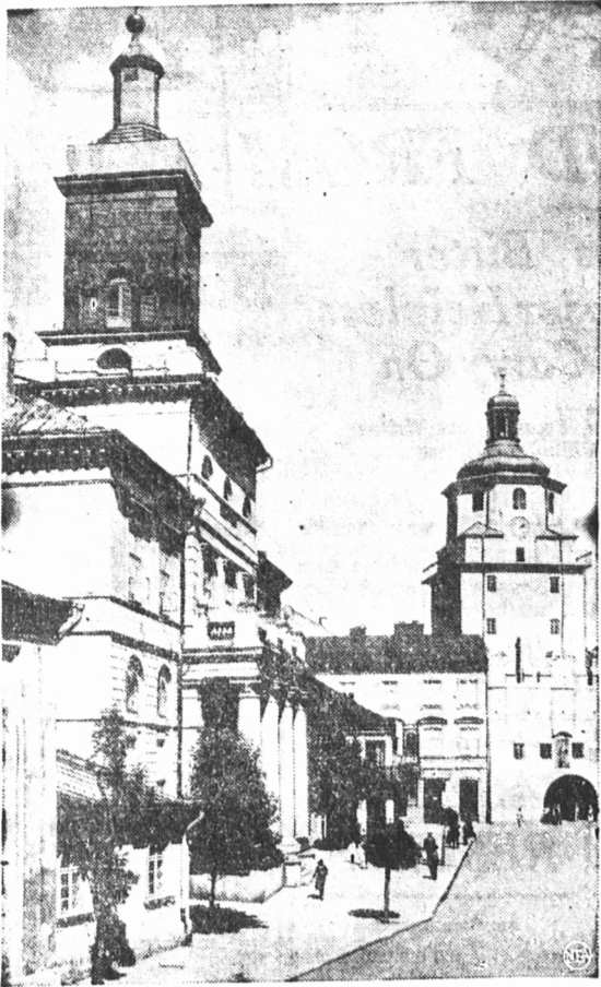
New seat of Poland's government is reported to be Lublin, 100 miles southeast of Warsaw. In above picture, the Lublin city hall is at left.