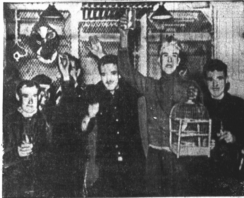
Part of the crew of the torpedoed British freighter Olivegrove is shown aboard the S. S. Washington drinking a toast to their rescuers. With their canary mascot, the entire crew of 33 was saved by the American liner about 200 miles southwest of Eanry, Ireland, where the torpedo sent the Olivegrove to the bottom.