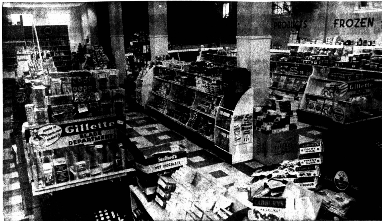
Shows The Splendid Display Scheme of Atkinson's