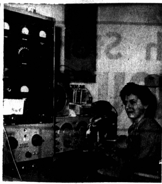
Telephone - Radio Service The longest breakdown of communications to West Prince County since telephone lines were extended to this part of Prince Edward Island was only a part of the heavy property loss caused by the freezing rain storm which started Jan. 5th.

UNKNOWN DIABETICS It is estimated that Canada has 225,000 persons suffering from diabetes, although only 135,000 cases have been diagnosed.