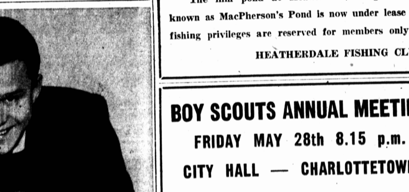
The Four Lads who will be seen here at the Rollaway Club Wednesday, June 2nd.