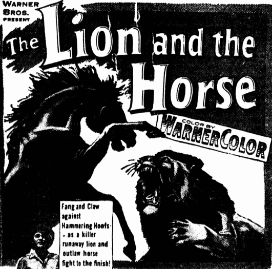
Fang and Claw against Hammering Hoofs - as a killer runaway lion and outlaw horse fight to the finish!