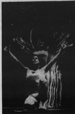
Stuttgart State Theatre Ballet