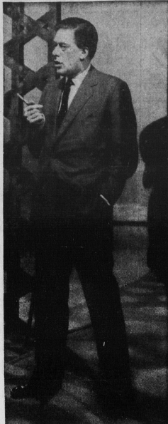
The Earl of Harewood, Artistic Director of the Edinburgh International Festival