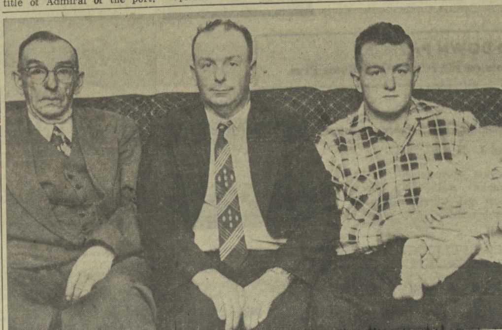
FOUR GENERATIONS AT PARTY