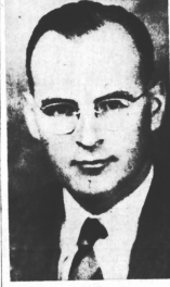
J. A. MacDONALD, M.P.

Wall Street prices were tumbling within hours of the announcement of the president's illness. The fact that Churchill had been stricken remained one of the world's best-kept secrets for 12 months until close friends revealed a few of the details.