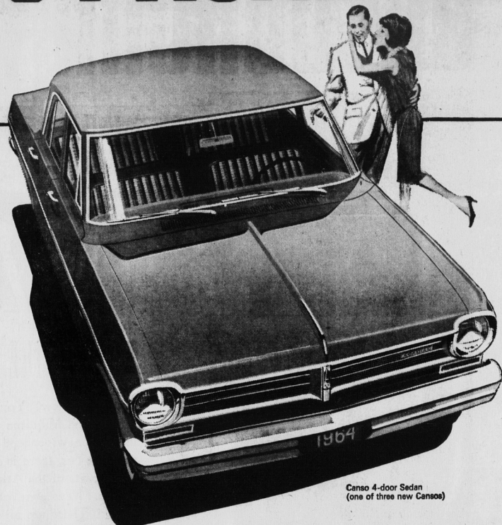
Canso 4-door Sedan (one of three new Canso's)