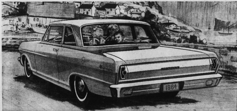
Invader 2-door Sedan (one of three new Invaders)