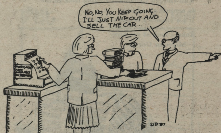
The Charlatan GRAPHIC BY BARRY