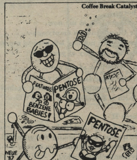
PENTOSE: The bachelor magazine for monosaccharides.