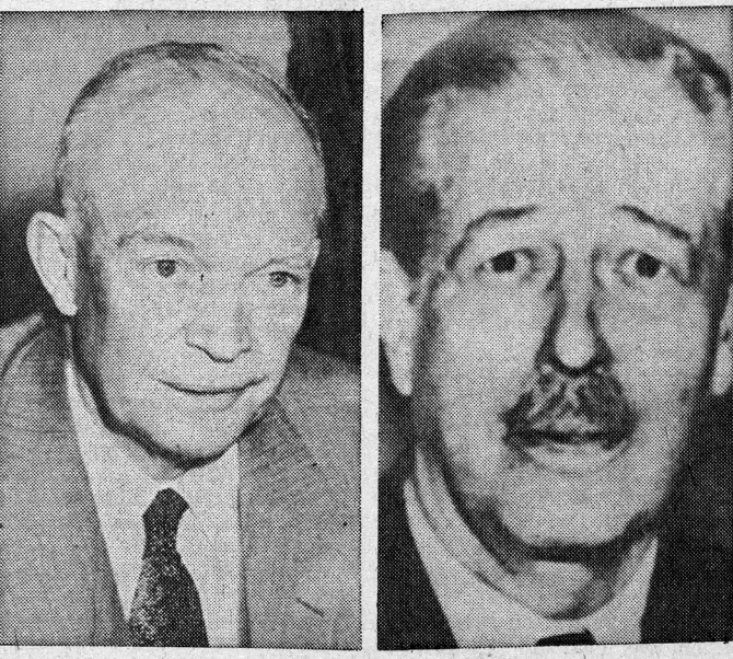
THE PRESIDENT THE PRIME MINISTER

WASHINGTON (CP)—The government was told Thursday that both industry and consumers plan to reduce their spending this year, dimming hopes that a quick resurgence of private demand would hasten the end to the recession in the United States. Two official studies were issued which are expected to reinforce congressional cries for stepped-up federal spending or tax reduction or both. A study by the highly-regarded University of Michigan survey research centre said consumers are less confident of the business outlook and plan to cut down spending on houses, new cars, home appliances and furniture. The industry report was a joint undertaking by the department of commerce and the securities commission. It said businessmen expect to cut their spending for new plants and equipment to $32,000,000,000 this year, as compared with last year's record figure of $37,750,000,000. Such capital investment is a prime source of new jobs. Union leaders told President Eisenhower Thursday that there is no use pinning hopes on quick economic improvement because all signs point to a worsening of the recession. An eight-man delegation led by AFL-CIO president George Meany and Walter Reuther handed him a "crash program" in a White House conference. It called for reduced taxes, increased unemployment insurance and step-ups in defence and public-works spending.