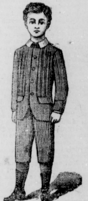
SEE OUR Boys' Suits, Reefers and Overcoats.

WALK IN —AND SEE OUR— Great Stock —OF— CLOTHING.