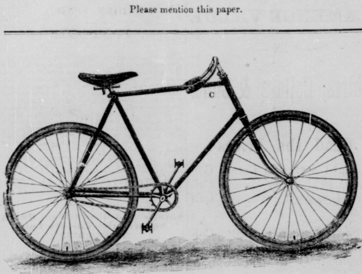
This is the wheel that was illustrated in "Haring's," the Cycling Authority on America," January 20th, 1895, over the following title: "The Handsomest Model Shown at the Recent National Cycle Exhibition." It is the WATERLEY SCORCHER, and is the most admired and talked-of high-grade bicycle in the world to-day. Want a bicycle? Illustrated catalogue free. Good agent wanted.

INDIANA BICYCLE CO., Indianapolis, Ind., U. S. A.