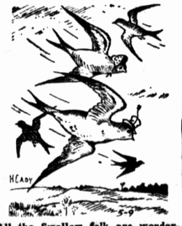
All the Swallow folk are wonderful when flying.

Peter says that right is right and wrong is wrong and fighting doesn't change the facts at all. All the fighting in the world will not change right and wrong. So, wisely, Peter very seldom fights. It takes a great deal to make him lose his temper and he very seldom fights.