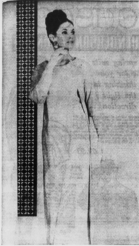
Elegant summer evening ensemble was designed by Frances Stewart of Ottawa for the spring collection of the Association of Canadian Couturiers. The coat, in gold 65 per cent "Terylene" 35 per cent cotton broadcloth, is caught at the neckline with a large, decorative button. Trim falls open revealing the dress beneath. The gown, in fresh