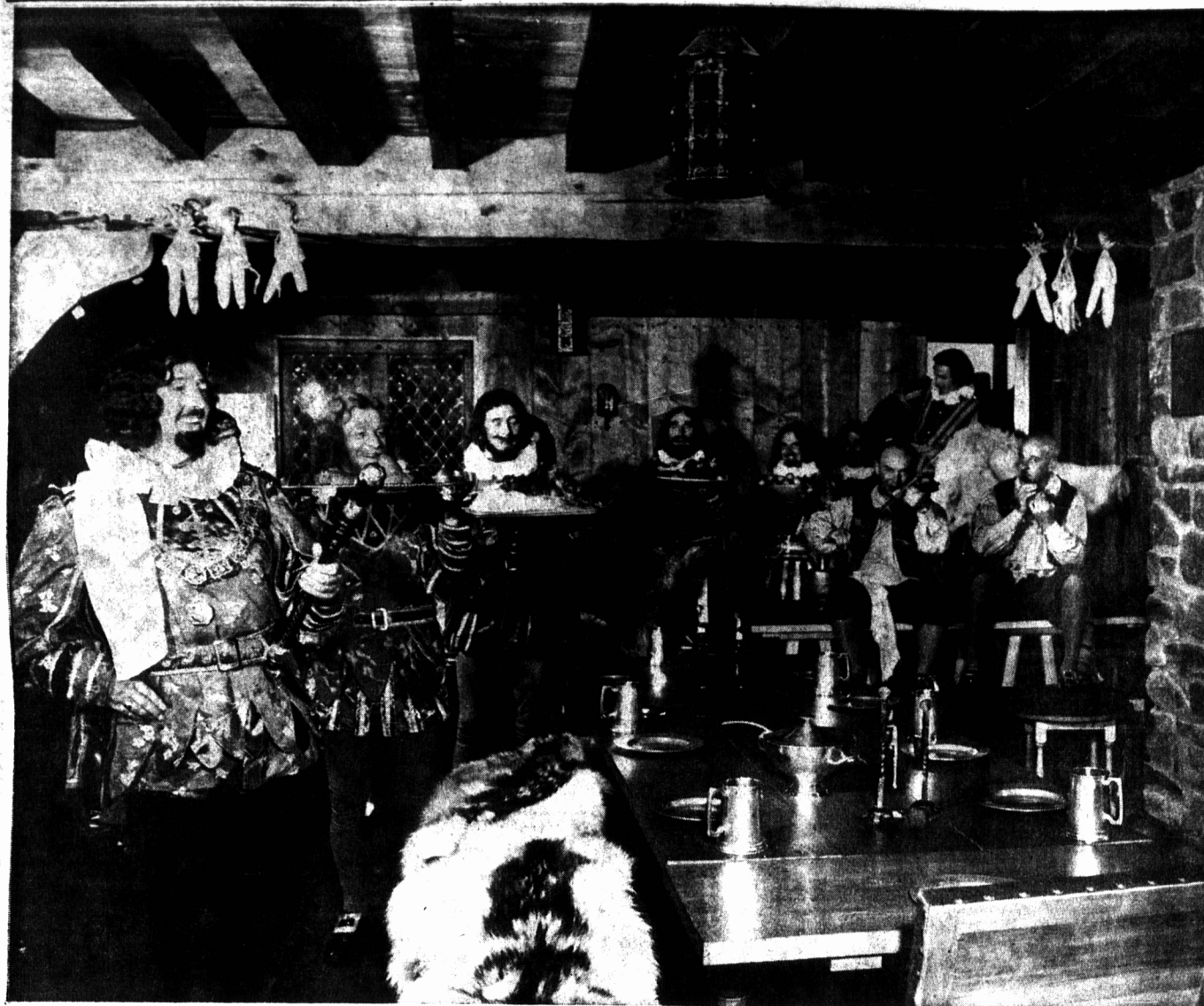
THE ORDER OF GOOD CHEER

Members of Canada's oldest social club, the Order of Good Cheer, don the dress of French