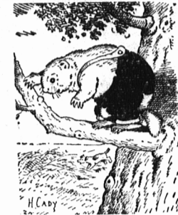
"What shall I do?" whimpered Johnny.

Peter Rabbit is safest when he is in the dear Old Briar-patch. He knows it. Mrs. Peter knows it. He knows it because she is always reminding him if it. But Peter likes adventure. He likes excitement. He has the wandering itch in those long legs of his. He just cannot stay at home long at a time. So, despite the fact that fear always goes with him, he is forever slipping away from the Old Briar-patch when Mrs. Peter isn't looking. Right now Peter was wishing he was back there. He was wishing it very much. Flip the Terrier was chasing him, and Peter was having to run for his life. To make it worse he was having to run away from the dear Old Briar-patch instead of toward it. At just about the time when he was getting out of breath and his long hind legs were beginning to get tired, he came to a pile of brush under which he could crawl and where Flip could not follow him. He was safe. Flip barked all sorts of threats of what he would do, but couldn't. Dogs and some other folks are like that. They threaten dreadful things