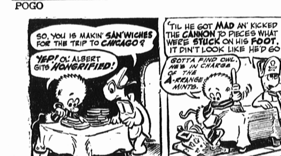
Napoleon and Uncle Elby