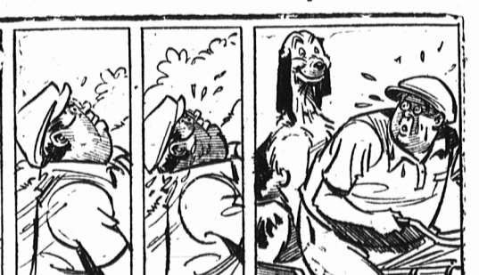
By Alex Raymond