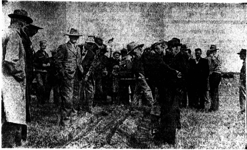
The critics take a careful look at the work of a competitor at the Dundas Plowing Match yesterday.