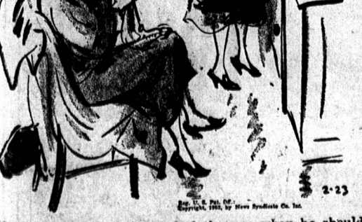
"My husband says he's reached the age when he should slow down on work. I've been waiting for him to get started."