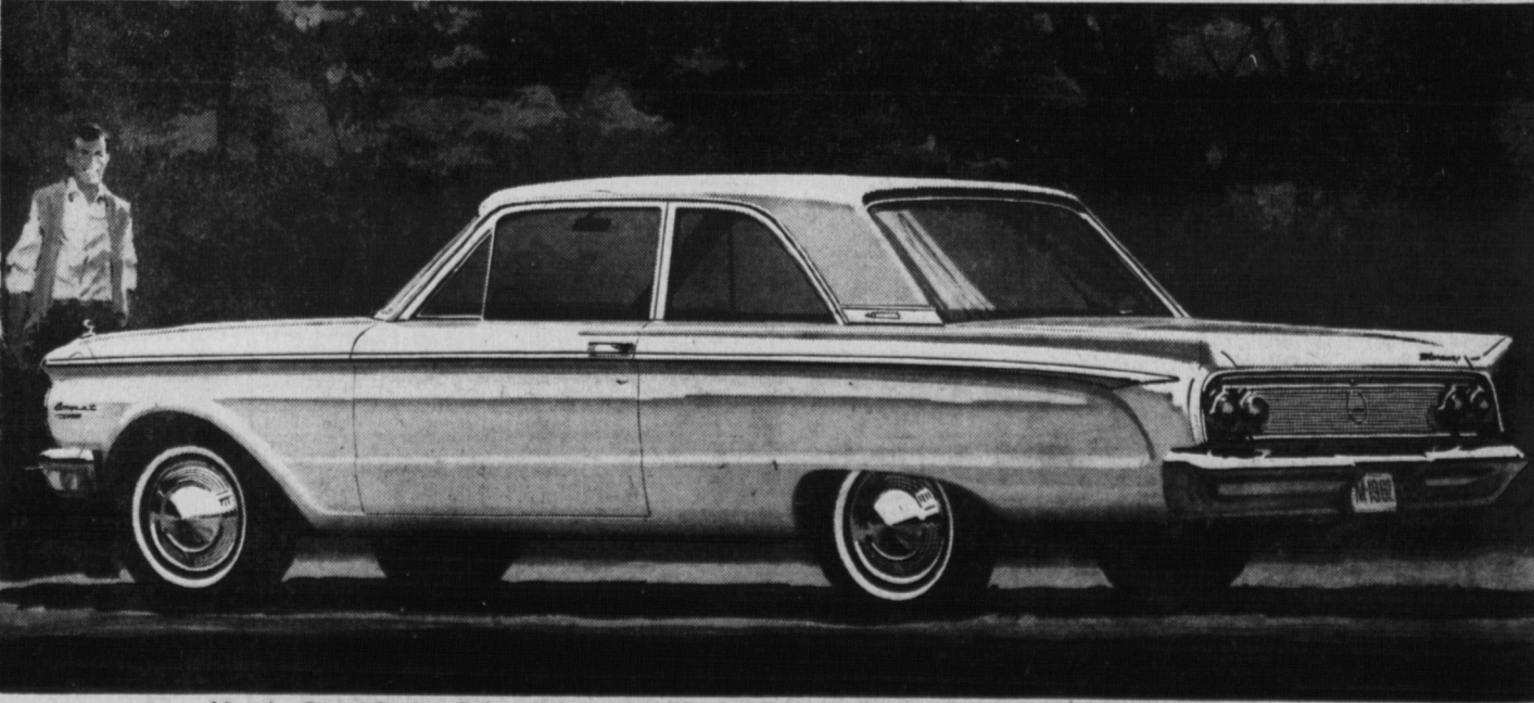
Mercury Comet Custom 2-door sedan...one of Ford of Canada's fine cars, built in Canada.

Success hasn't gone to its price The 1962 Comet repeats everything that made it the success compact of '61, but adds benefits that put it even farther ahead of the compact crowd. Comet has the fine car styling of a Mercury. Comet gives you a wheelbase 4 inches longer than most compacts. (You'll love the beautiful ride this provides.) No doubt about it: the new Mercury Comet is a compact—but doesn't look it or act it. And with all these extras it's still priced with anything else in the compact field. Size up Comet today! Here's what keeps Comet ahead: 6,000 mile oil change cycle • 30,000 mile anti-freeze • galvanized steel body parts • double wrapped aluminum muffler • super enamel finish • choice of 85 hp. or 101 hp.* engine • automatic* or standard transmission • 2 and 4 door sedans and station wagons • S-22 with bucket seats and special appointments* • Dealer warranted for 12,000 miles or one full year, whichever comes first. Wheel covers, whitewall tires, and items marked with (*) are optional, at extra cost. To get all the facts, ask your Mercury dealer for your free "Comparison Guide"