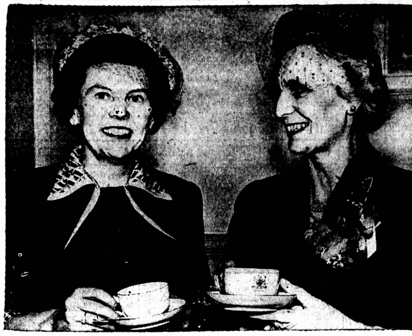
Reception by the lieutenant-governor, Hon. Ray Lawson, followed the opening of the Ontario Legislature...