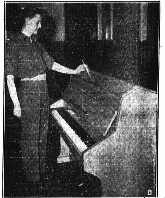
THE LONG-SUFFERING canteen piano, beaten and banged by the serviceman, is at last fighting back—at least so far as the British are concerned. Pictured trying to do the impossible—to park his glass on the sloping top—is a Tommy. Sloping sides and keyboard also discourage similar attempts with glasses or cigarettes. Other fighting features: solid oak construction, brass kicking plate around pedals, copper keyboard ends (for ashtray use) and non-inflammable, cigarette-stainless, plastic keys. Already in use in a London barracks, the piano may soon be defying Tommies where they stand against Communism in places like Korea and Malaya.