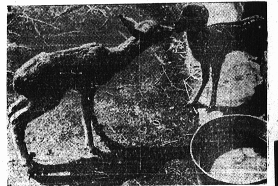
Just one day old, these two deer at London zoo are becoming acquainted with one another by the simple process of rubbing noses. Even at this age they can run fast.