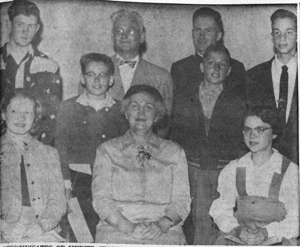
"CERTIFICATES OF MERIT" awarded by the Rotary Club of Lytham, England for their art drawings shown at the International Youth Exhibition were presented at Rotary yesterday.