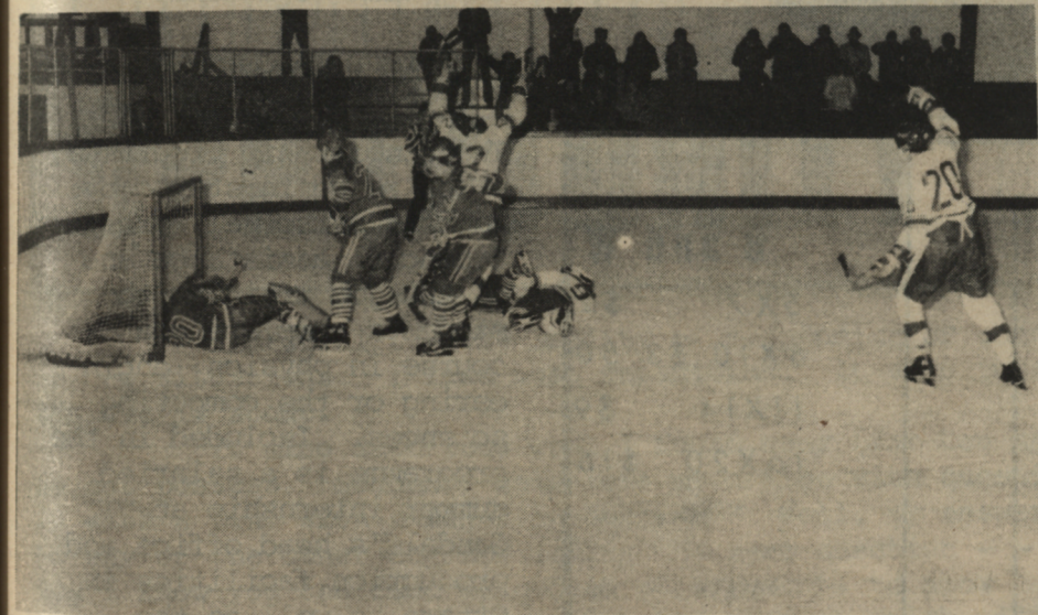
Hockey Panthers Score Again

when was the last time a UPEI team won 4 in a row????