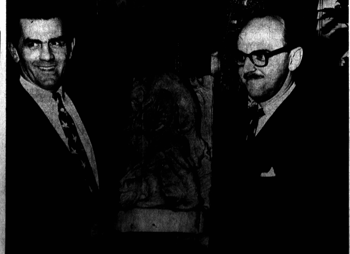
The Rocket Is Honored On 400th Mayor Jean Drapeau presents Maurice (Rocket) Richard of the National Hockey League Montreal Canadiens with a wood carving at a reception in Montreal's City Hall. (The reception, in honor of Richard, was organized after he scored his 400th goal in a game against Chicago Black Hawks.