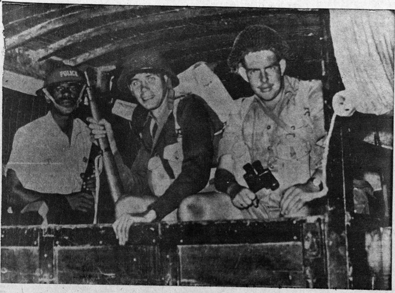
LAND AT NASSAU British troops from Jamaica, B. W. I. arrive at Nassau's International Airport just after midnight Thursday. The armed forces were brought in as preventive measure in Nassau's current labor dispute to preserve law and order. Three plane-loads of troops were flown in to the resort isle where some 4,000 strikers have been out since last Sunday.