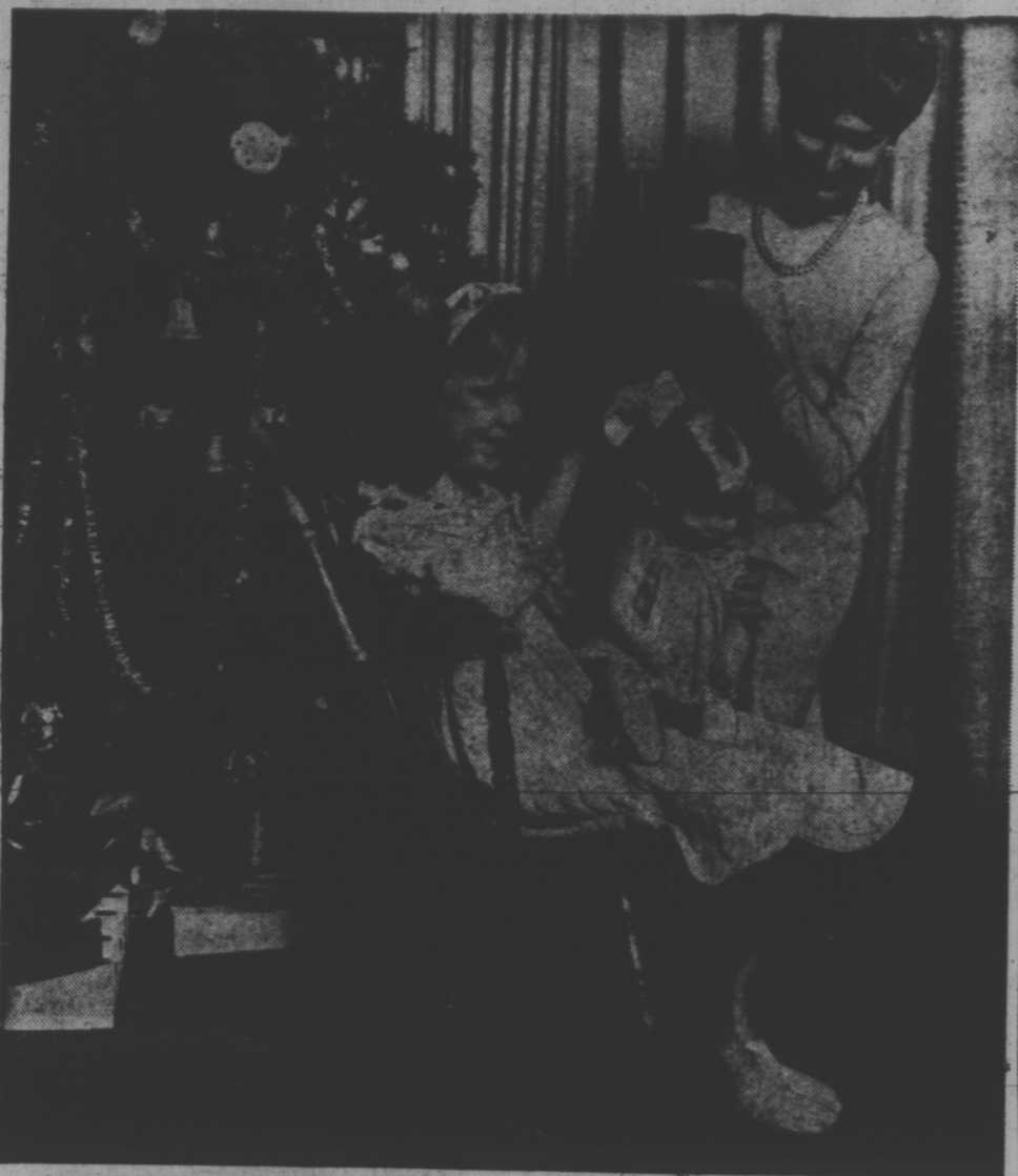
CAPTURE the joy of Christmas morning with the aid of a movie camera.