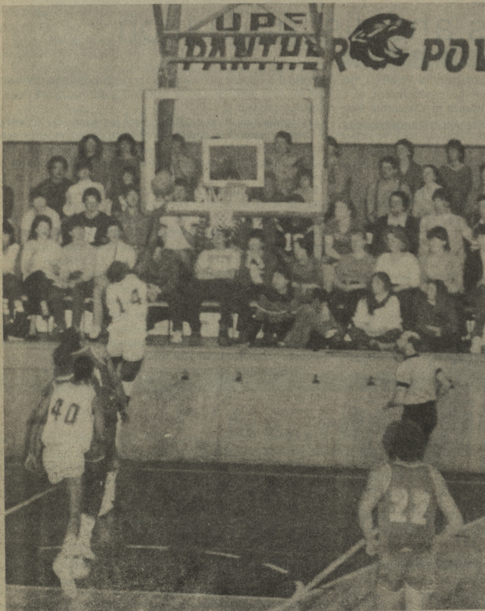
Yes, we realize this is an old picture, but we couldn't afford to send anyone to Halifax last week. This is good enough, isn't it?

Applications close 5 p.m. March 17, 1984.