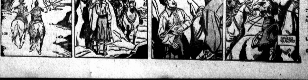
By Fran Striker