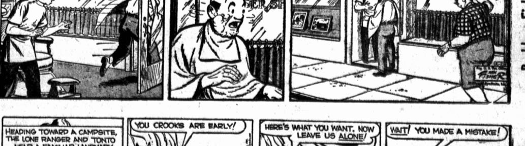
By Ham Fisher