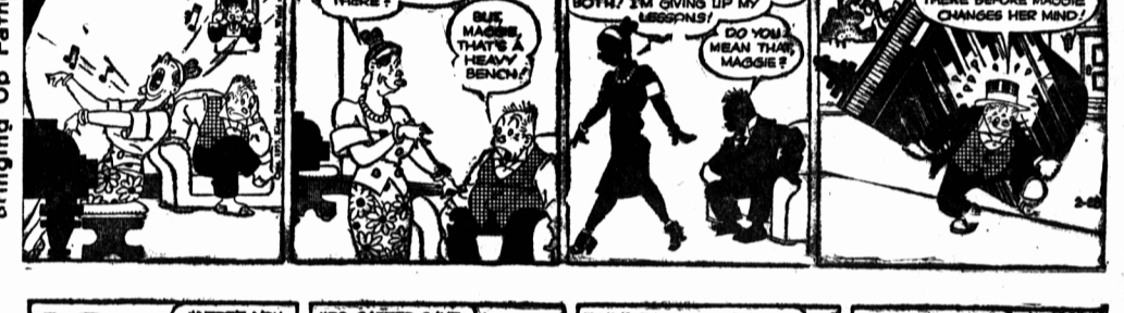
Bringing Up Father