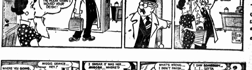
Tilly The Toiler