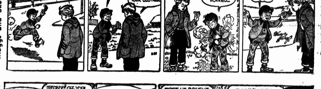
Mugs and Skooter