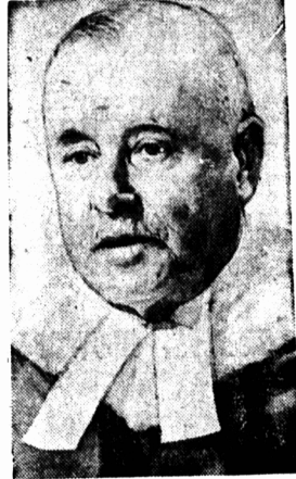
CHIEF JUSTICE RINFRET

It has been rumored in Ottawa that Finance Minister Douglas C. Abbott will be appointed chief justice of Canada when parliament prorogues later this month. Mr. Abbott's appointment to the highest judicial post in Canada will be made some time after June 22 — which is the 75th birthday of chief justice Thibaudeau Rinfret, and the day he reaches the compulsory retirement age. Now 55, Mr. Abbott began his law career in 1918, at McGill in Montreal, graduating with a degree of bachelor of civil law in 1921. In 1929 he was made K.C. and a year later he began his political career when he was elected to the House of Commons as M. P. for Westmount-St. Antoine, the first Liberal to represent the riding since Confederation. Three years later he was appointed parliamentary assistant to the finance minister.