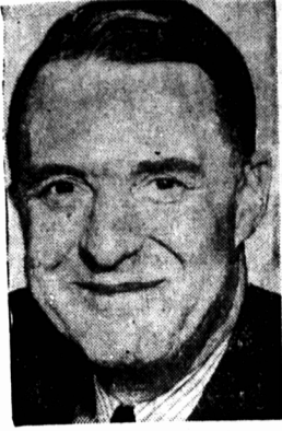
HON. DOUGLAS ABBOTT