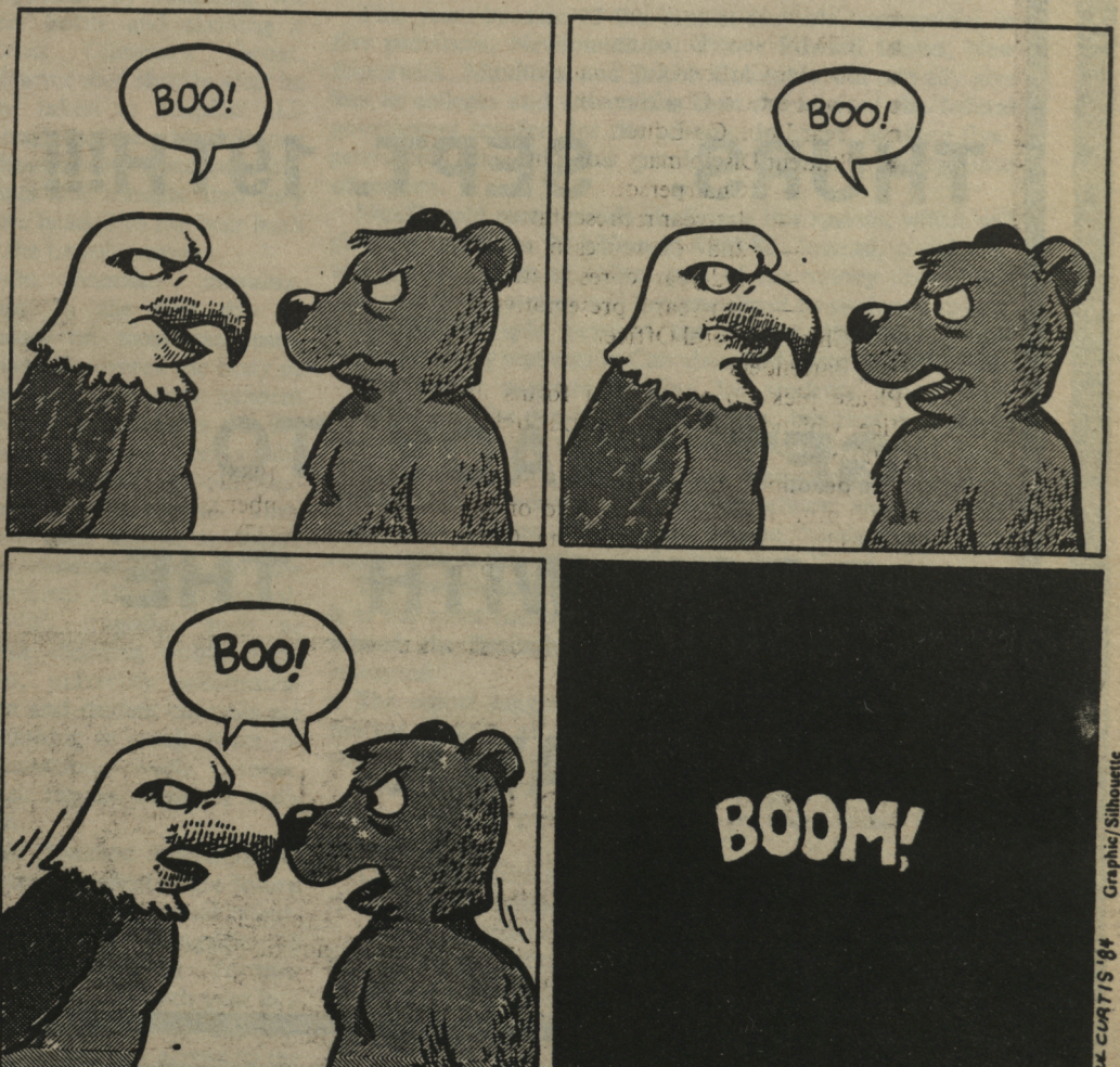
PAUL CURTIS '84 Graphic/Silhouette