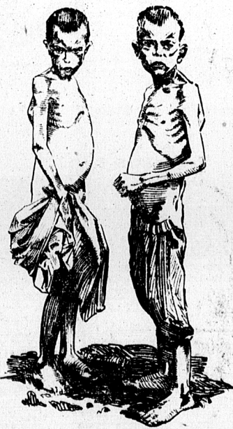
Two boys brought to the Relief Station in Saratoff

RT. HON. ARTHUR MEIGHEN HON. T. A. CRERAR HON. RODOLPHE LEMIEUX